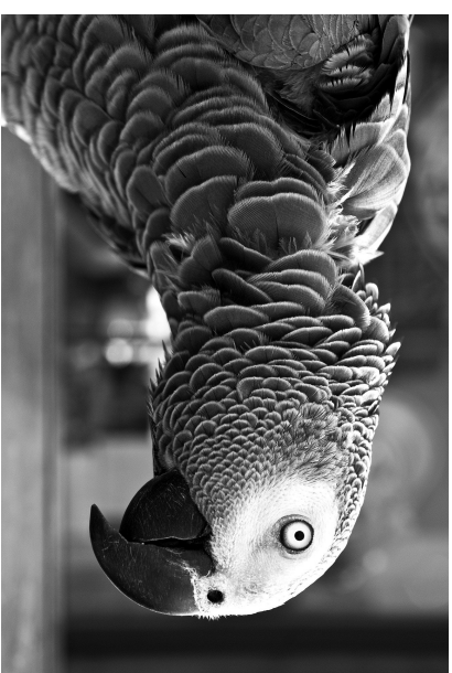
Figure 3.1: A parrot, https://www.dropbox.com/s/8r4svs6ubhgwaWt/parrot.png

It is a fact, that the truncated SVD, i.e.,